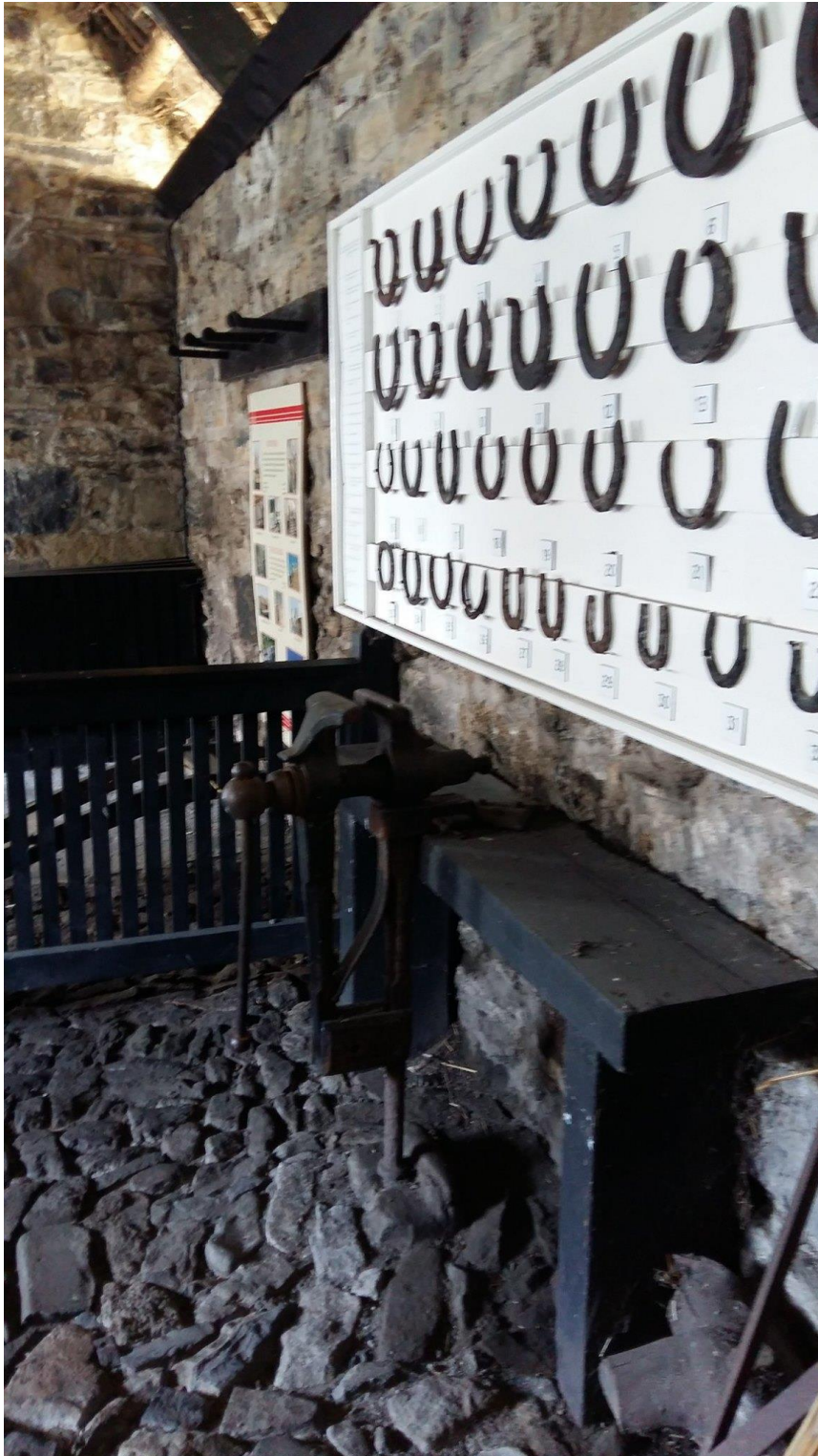
Have a look at our interesting collection of horse and donkey shoes on display. We even have an old bellows over 100 years old!